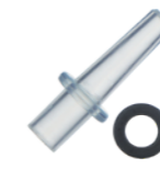
WG01-010-002-005 Two-way tube+magnetic connector