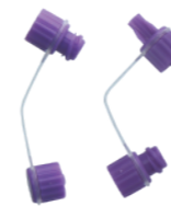
WG01-010-002-001 Female connector, cap on strap