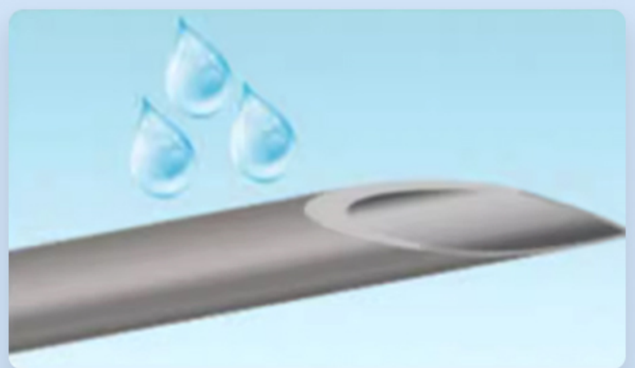
Double siliconized lubrication treatment