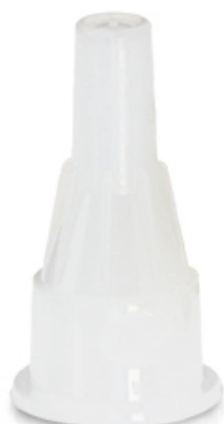
Needle seat protective cover