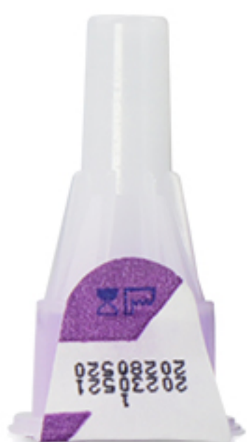
Sealed dialysis paper