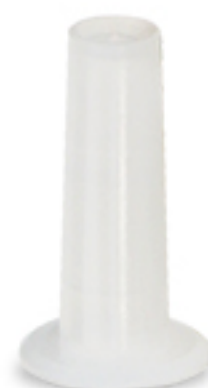
Needle tip protective cover