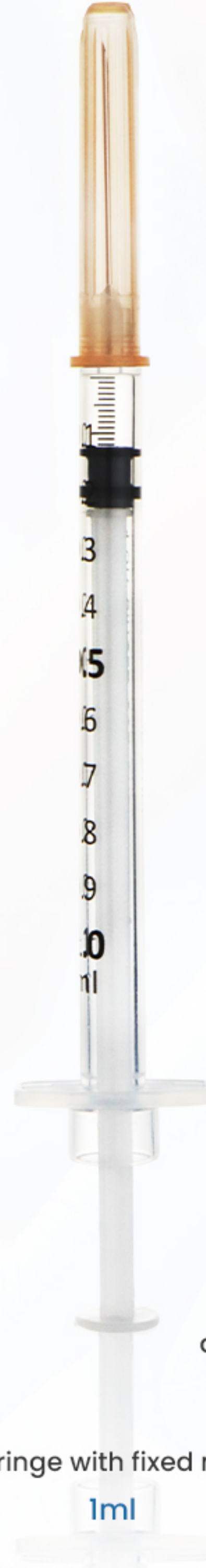
Syringe with fixed needle