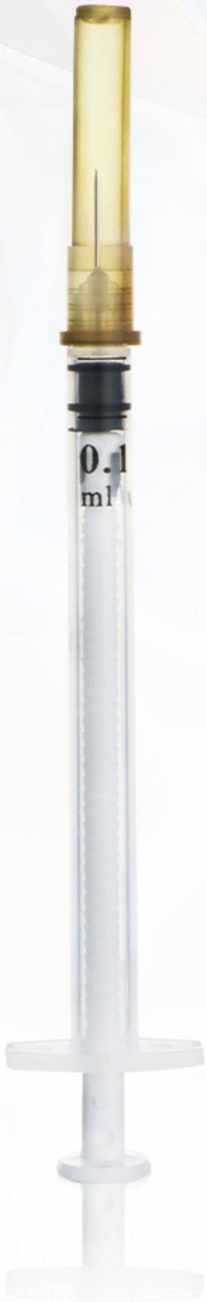
Syringe with fixed needle (Auto- disabled)

Complete specifications , wide application range