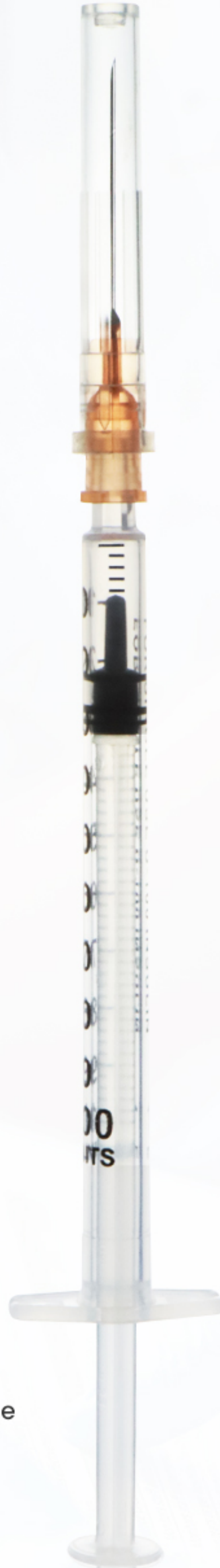
Syringe with detachable needle(luer slip)