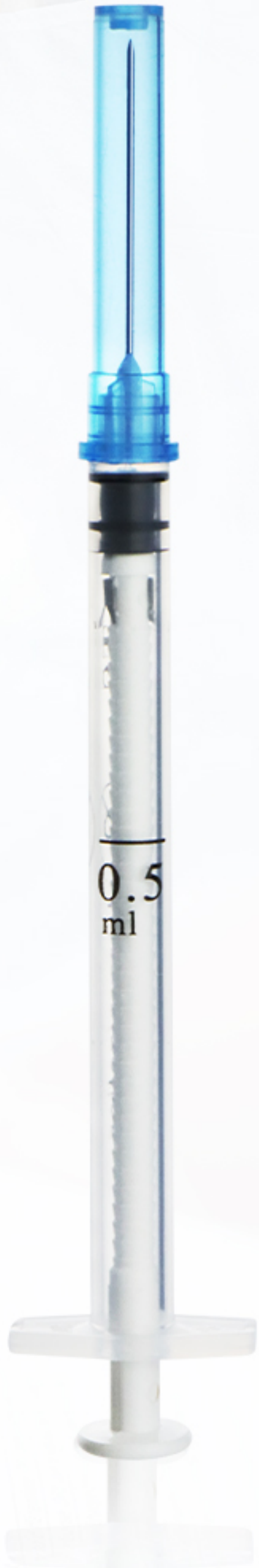
Syringe with fixed needle (Auto- disabled)