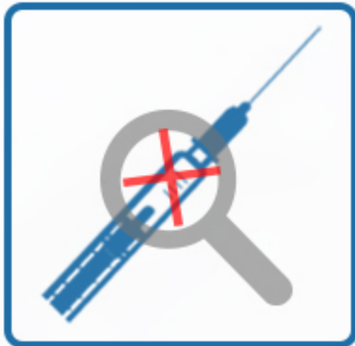
LESS WASTE OF DRUG