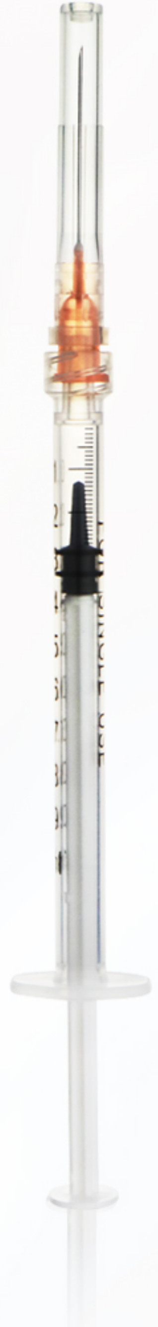
Syringe with detachable needle(luer lock)