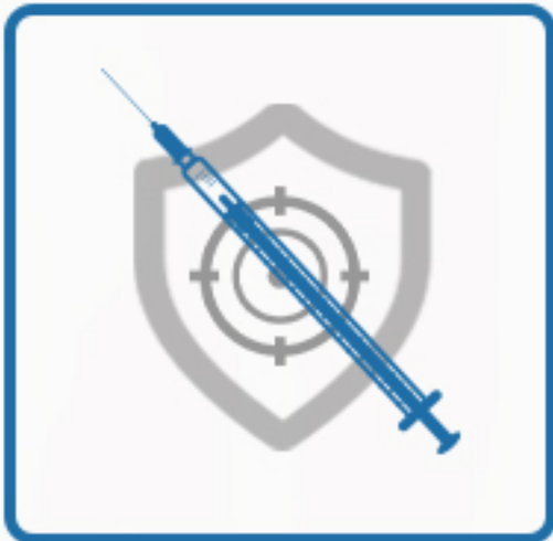
MORE ACCURATE DOSAGE